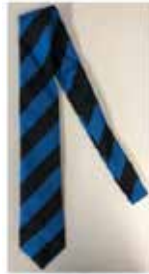
Gilbert House Dame Sarah Gilbert - Science