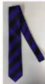
McQueen House Sir Steve McQueen - the Arts

The House system is a key vehicle in promoting the RESPECT ethos, student leadership and community engagement; as well as being intrinsically linked to the Academy's reward systems. Every student will join one of our four Houses.