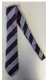
Peake House Major Tim Peake - Exploration