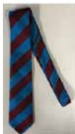
Hamilton House Sir Lewis Hamilton - Sport